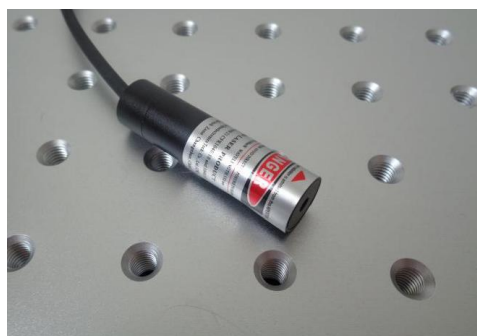
Φ12×45(L) mm 2 , 0.01 kg